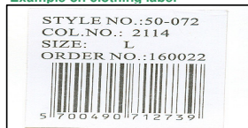
Example on clothing label